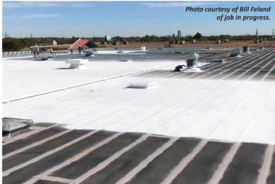
of job in progress.

“I like the versatility, strength, and waterproofing capabilities of the Membrane Coating System. The available 10-year warranty* gives both my customers and I peace of mind. The high-quality Spunflex® fabric used in this system is flexible and easy to work with. Due to coastal wind uplift and potential hurricanes, having a seamless commercial roofing system is a must here in south Florida!”