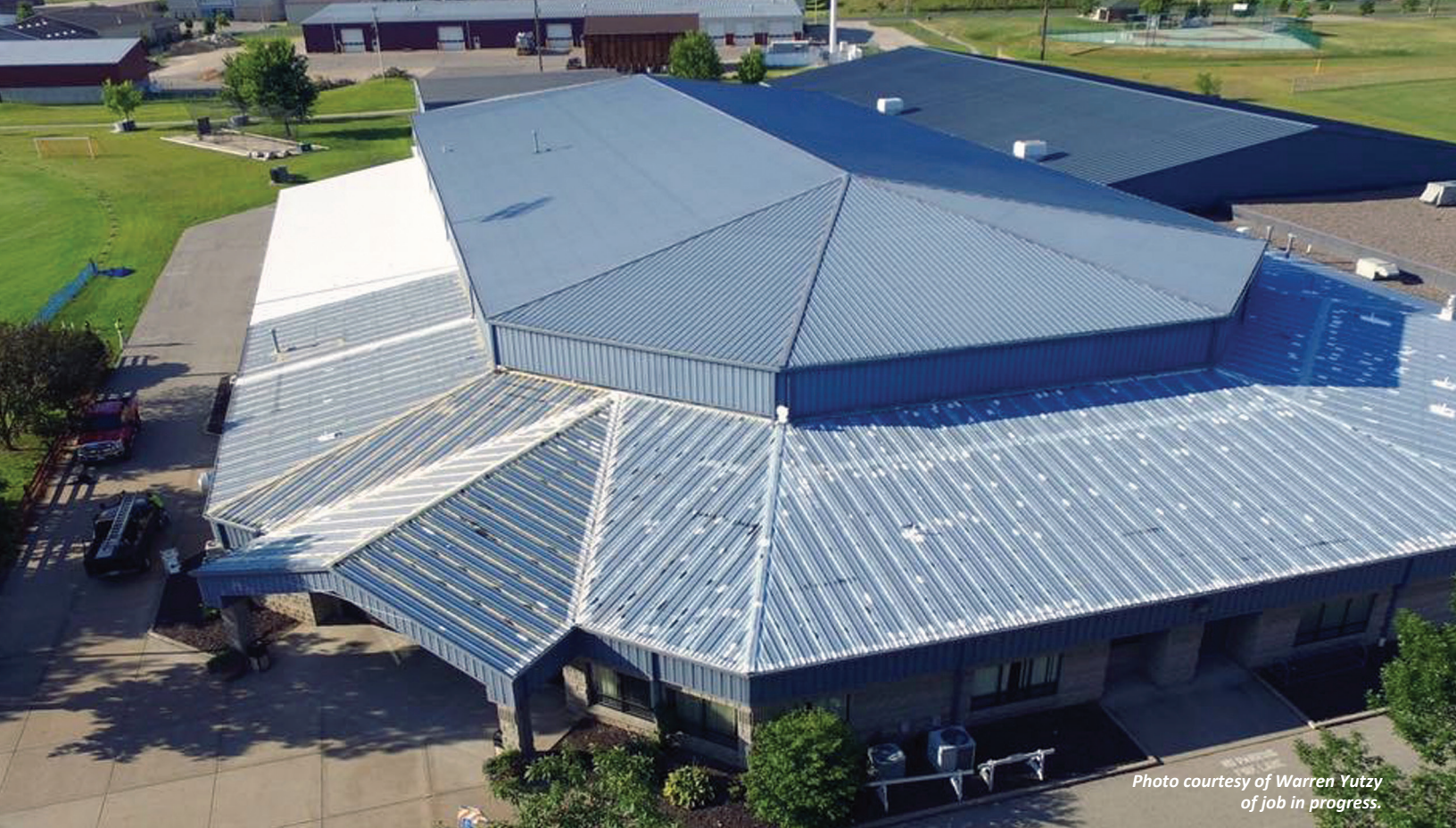
of job in progress.