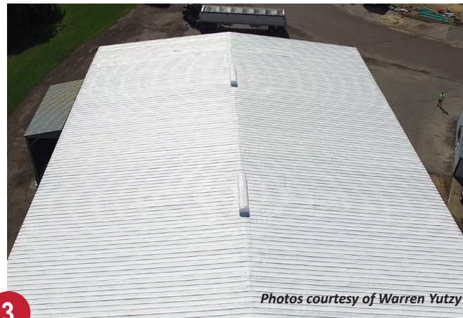
Metal roof after application of Spunflex® fabric and Benchmark® base coat to the seams along with Kwik Kaulk® sealant application to the fasteners.